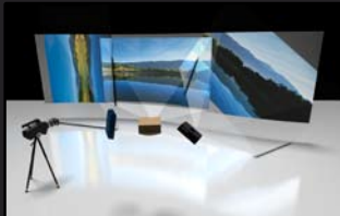
Different types of projectors can be used in various setups.