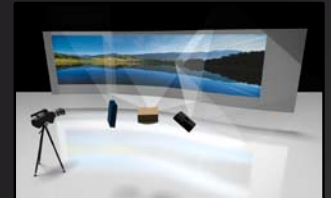
...and, based on the data collected, computes the perfect projection!

AV Stumpfl and VIOSO, a specialist in unusual, camera-based projections, are to present a joint media server product: WINGS VIOSO.